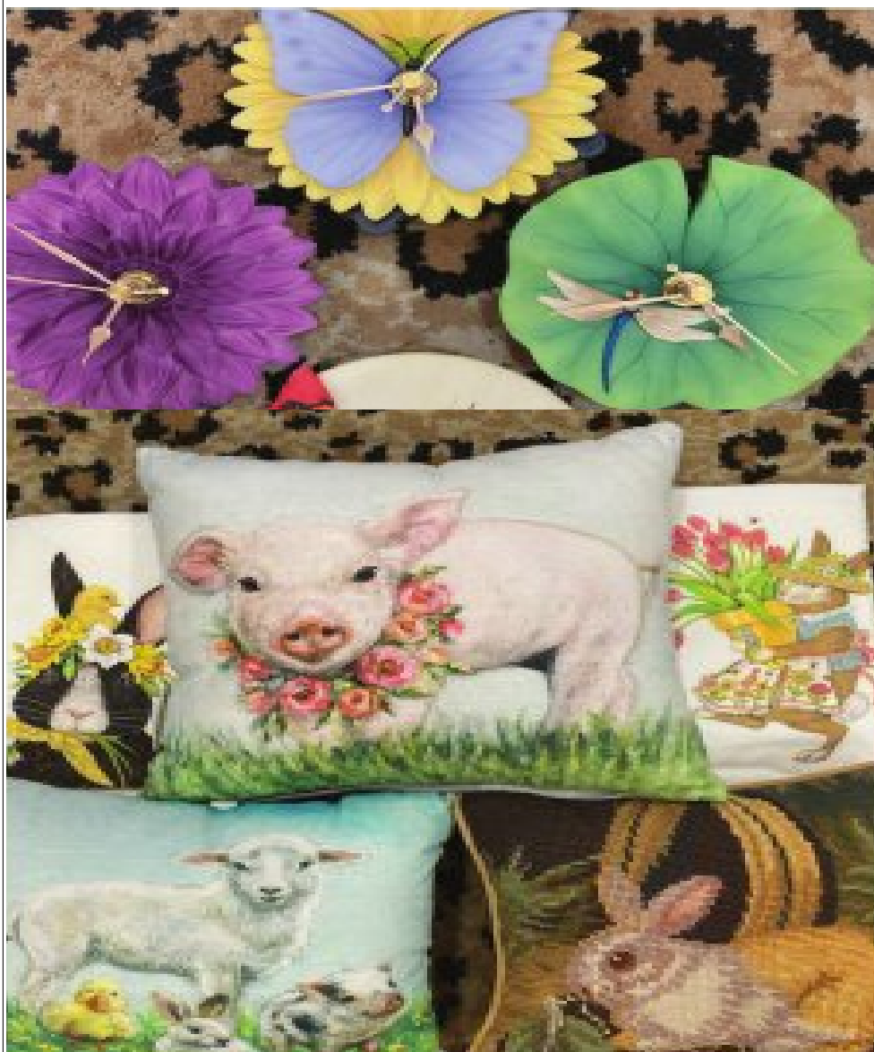
Patricia's Presents has gifts and accessories for your holiday gift giving. They are located at 164 Greenwood Avenue in Bethel.